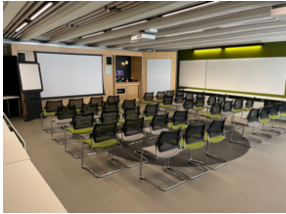
First floor seminar rooms in the Ramphal Building: