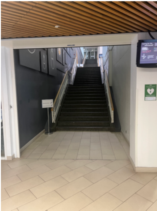
Top of the stairs / first floor lift: