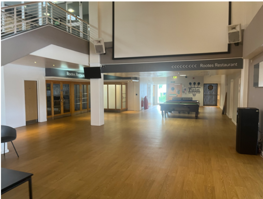
Inside the Rootes Restaurant (1):